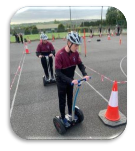
Senior Students trip to the National Ploughing Championships

TY students get active during a Segway workshop Our TYs recently participated in a segways workshop with @emovement.ie here in Scoil Aireagail. Students really loved showing off their skills on the segways. Thanks to E-movement for facilitating the workshop.